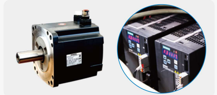
SIEMENS Servo motor control