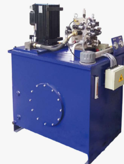
Servo energy-saving hydraulic system