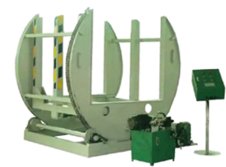
YS Board Turnover Machine