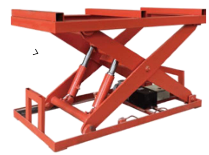
YS Light Hydraulic Lifter