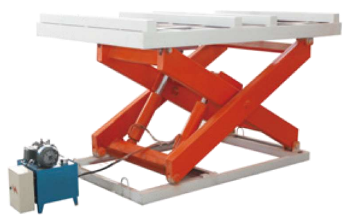
YS Hydraulic lifter