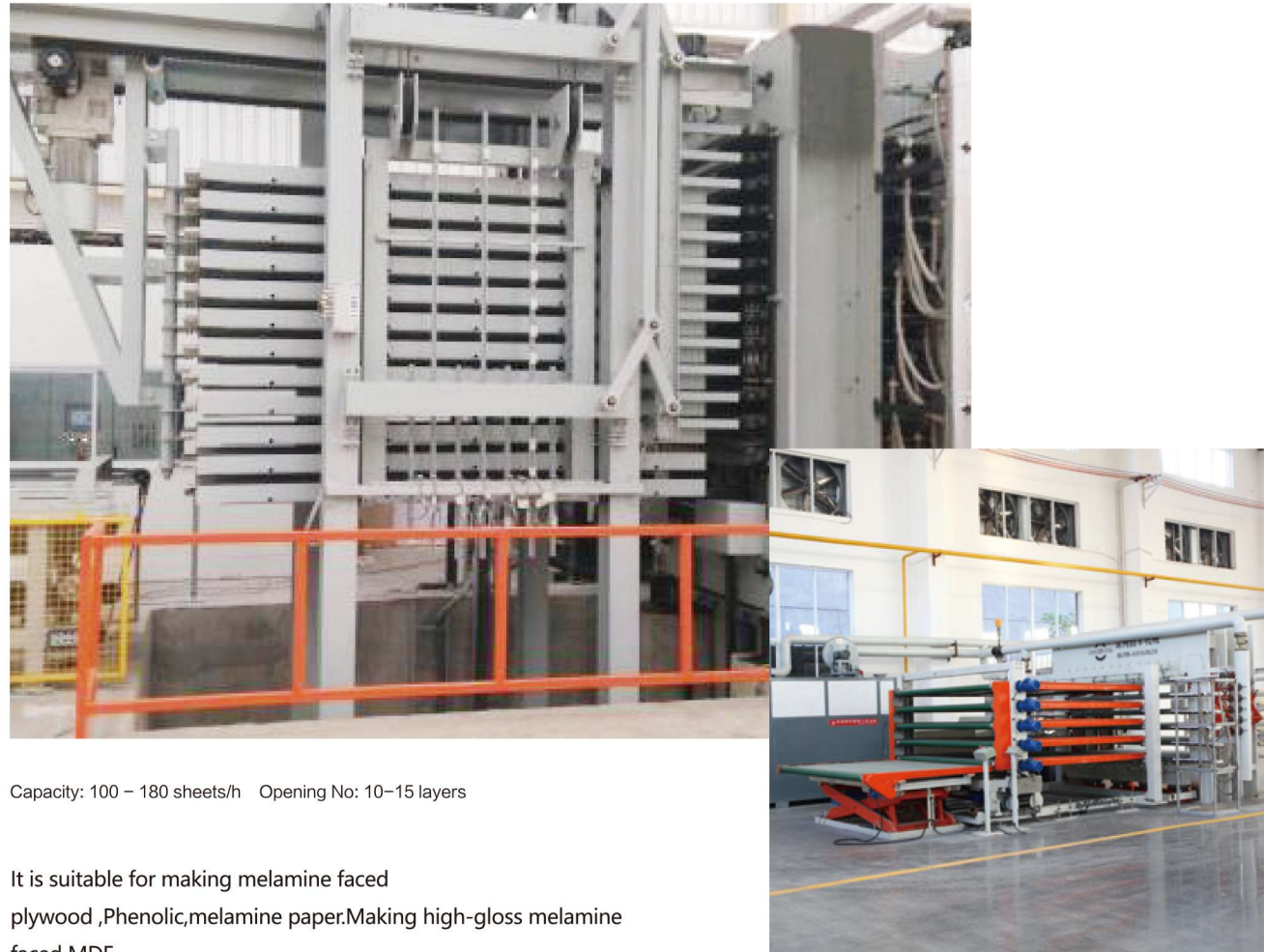
Capacity: 100 – 180 sheets/h Opening No: 10–15 layers

It is suitable for making melamine faced plywood, Phenolic, melamine paper. Making high-gloss melamine faced MDF.