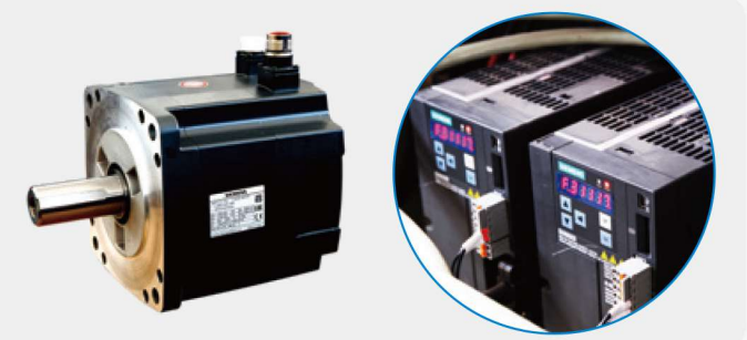
SIEMENS Servo motor control